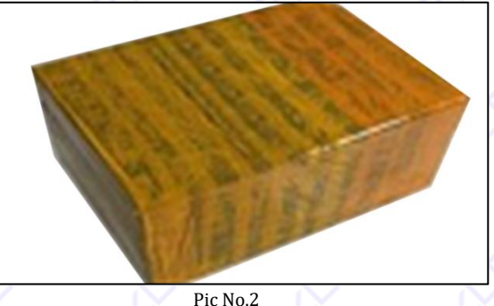
International express packaging: Wrapped with yellow tape after wrapping

Pic No.1 Domestic express packaging: Wrapped by Transparent tape