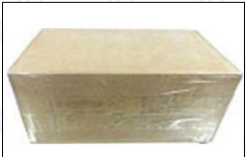
Pic No.1 Domestic express packaging: Wrapped by Transparent tape

Minors are prohibited from using transparent tape, yellow tape, black wrapping protective film, and white wrapping protective film to avoid personal injury.