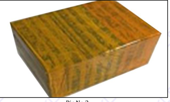
Pic No.2 International express packaging: Wrapped with yellow tape after wrapping

Pic No.1 Domestic express packaging: Wrapped by Transparent tape