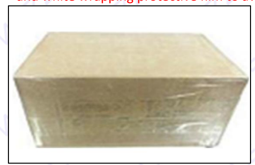
Pic No.1 Domestic express packaging: Wrapped by Transparent tape

⚠ Minors are prohibited from using transparent tape, yellow tape, black wrapping protective film, and white wrapping protective film to avoid personal injury.