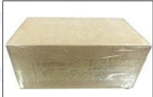
Pic No.1 Domestic express packaging: Wrapped by Transparent tape

Minors are prohibited from using transparent tape, yellow tape, black wrapping protective film, and white wrapping protective film to avoid personal injury.