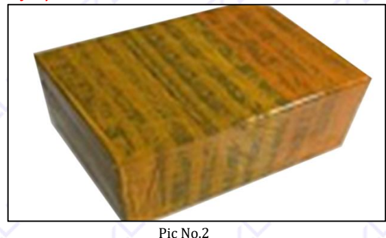
International express packaging: Wrapped with yellow tape after wrapping