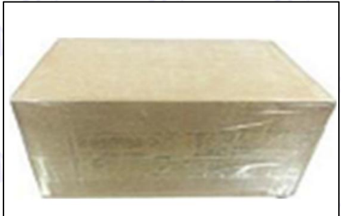
Pic No.1 Domestic express packaging: Wrapped by Transparent tape

Minors are prohibited from using transparent tape, yellow tape, black wrapping protective film, and white wrapping protective film to avoid personal injury.