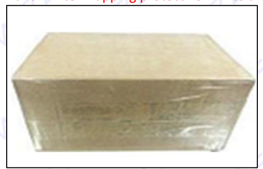
Pic No.1 Domestic express packaging: Wrapped by Transparent tape

Minors are prohibited from using transparent tape, yellow tape, black wrapping protective film, and white wrapping protective film to avoid personal injury.